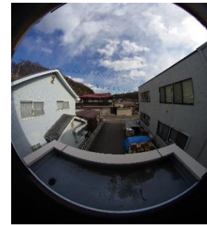
【OPT Ultra high resolution lens】 12M pixel