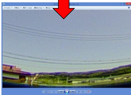
Image height is compressed in the fringe area.