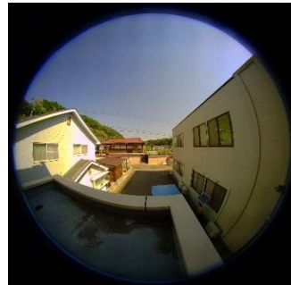
【OPT Fring Priority lens】 3M pixel