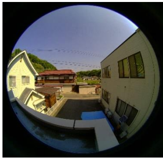
【Normal Fish-eye lens camera】 3M pixel