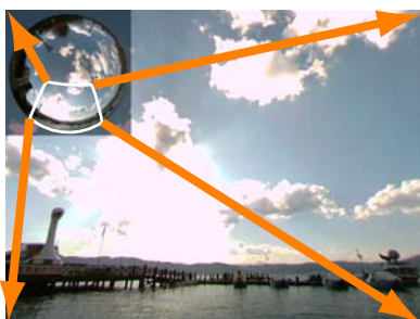
Sub-image can be ON/OFF

Example: to de-warp and enlarge a designated area