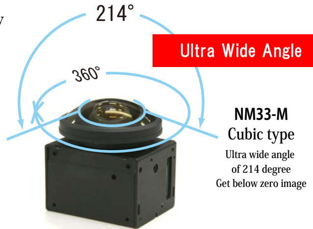
NM33-M Cubic type

Small body of 30 x 39 x 27mm Easy for handling