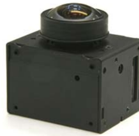
NM33-N/F Cubic type

Small body of 30 x 39 x 27mm Easy for handling